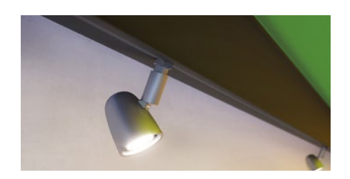
Perfection. All round. Whether you choose diffuse LED Line or accentuated LED Spot lighting.

Shapely curves, clean lines, a fascinating colour spectrum – these are the defining features of the markilux MX-3. The colour choice of the all-round styling panel offers a unique customisation option and makes the hearts of patio and balcony owners beat faster. When closed, the awning makes a good impression with its harmonious appearance and when open, it fully reveals its technical superiority.